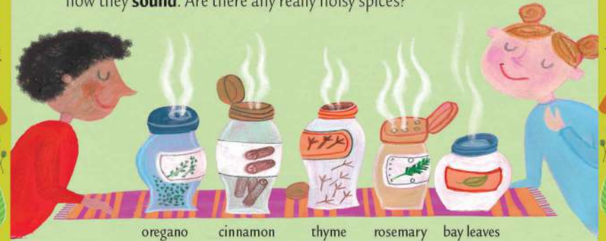
oregano cinnamon thyme rosemary bay leaves

1 Use your senses to explore the spices! First, give the jars a shake and test how they sound . Are there any really noisy spices?